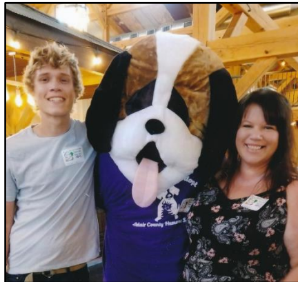
Above: White Oak Barn the evening of The Purrfect Tale. This was taken before we had to put up more tables.