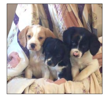
Adair County Humane Society

Mon - Fri: 9 AM - 4 PM Sat: 9 AM - 12 PM